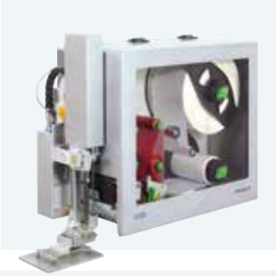
Label software cablabel S3