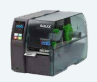
Label printers XC

Industrial device for print widths up to 108 mm