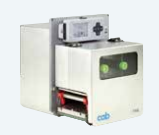
Label dispensers HS, VS