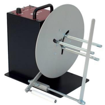
CAT-3-TA-ACH with APG

keep the unit from moving. The CAT-3 handles any rewind job and with its "HIGH" torque range can also power the LABELMATE S-100 or S-200 Label Slitters. Reliable, high quality and maintenance-free.